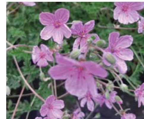
Erodium: Hummingbird Hawk Moths love it